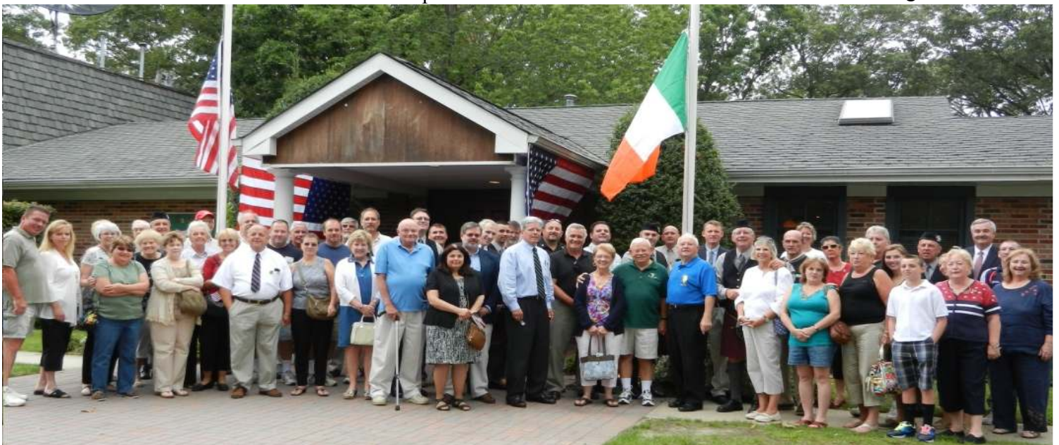
9-11 Memorial Service at Division Seven