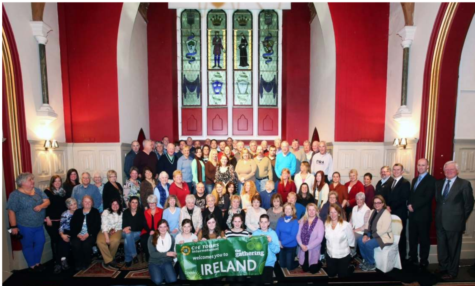
A.O.H. Division Seven's 50 th anniversary pilgrimage to Knock Shrine in Ireland Feb. 15 – Feb. 23, 2013