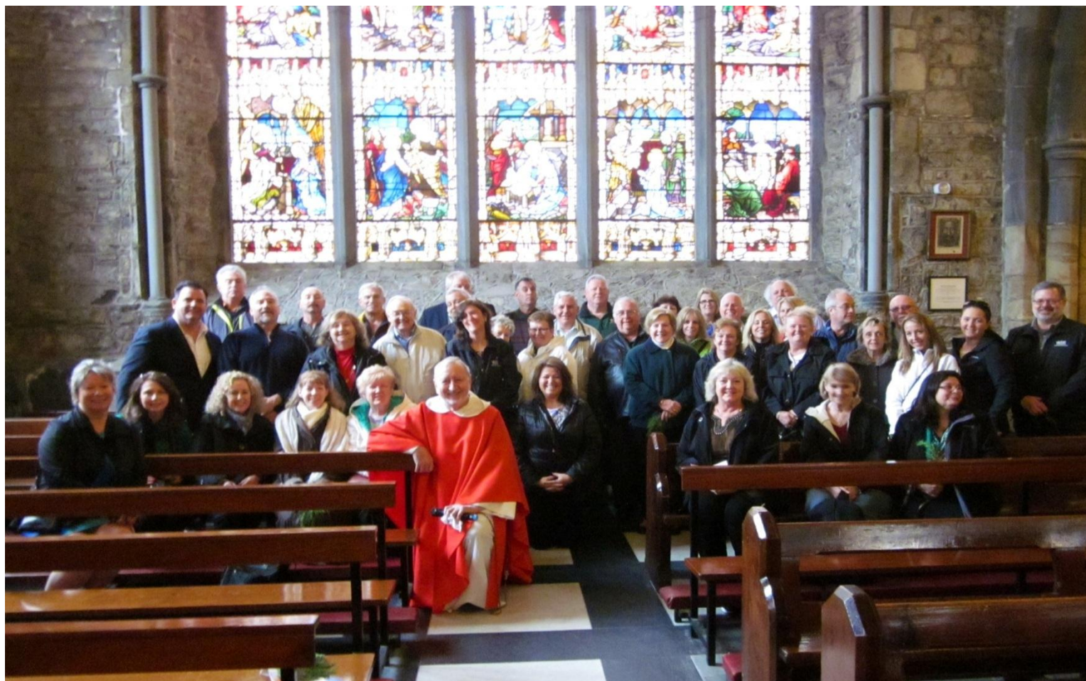
AOH Division Seven member's attended Palm Sunday Mass 2014 at The Black Abbey in Kilkenny, Ireland