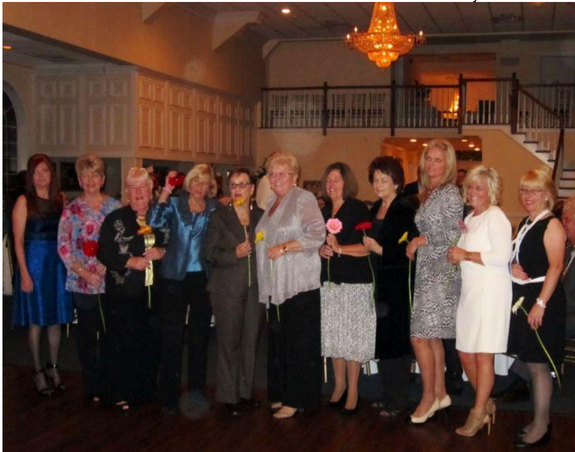
LAOH Past Presidents at the LAOH Division Seven 50 th Anniversary Dinner Dance

Televised Live Every weekend May through September $25 Donation See schedule at Division Seven Hall