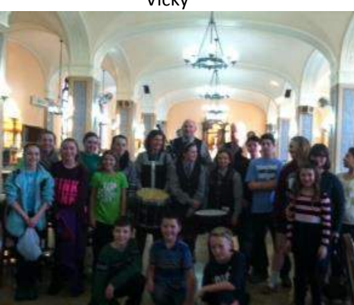
Junior Boys and Girls visiting with the Sisters at St. Joseph's Convent.