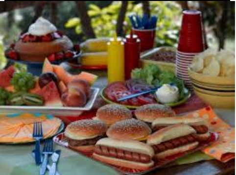
Saturday Sept. 16<sup>th</sup>, 2017 Noon – 5:00 PM Here at Division 7 this year $10 per adult Children 16 and under free