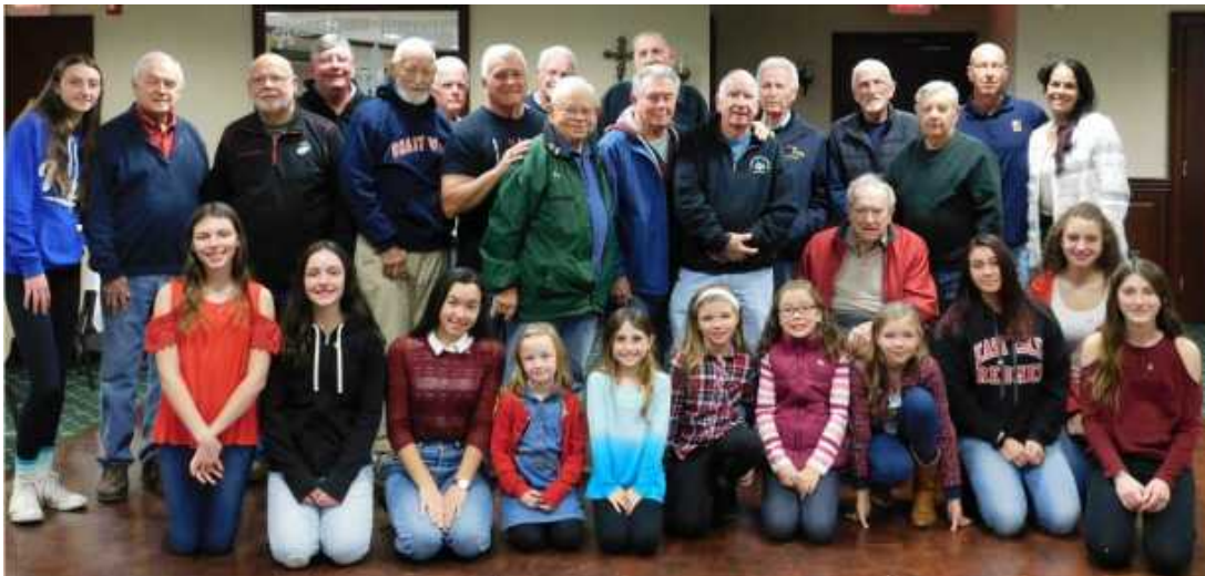
Junior Girls' with our veterans in photo above and decorating a tree at Brookwood Hall below.