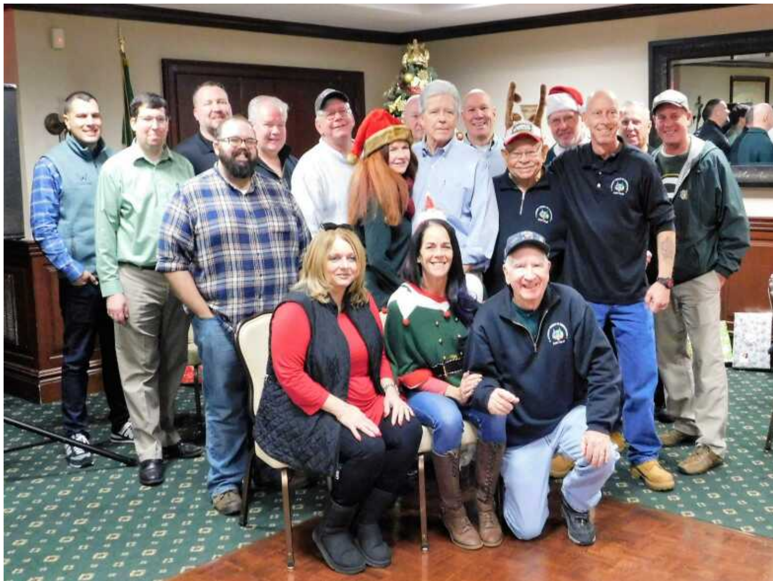
Children's Fund Christmas Party volunteers