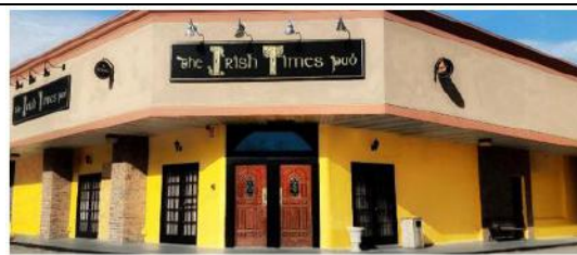
The Irish Times 975 Main St. Holbrook, New York 11741 - Phone (631) 467-4330