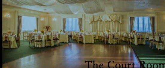
The Court Room

Full Service Catering 3 PRIVATE ROOMS CUSTOM TAILORED PACKAGES