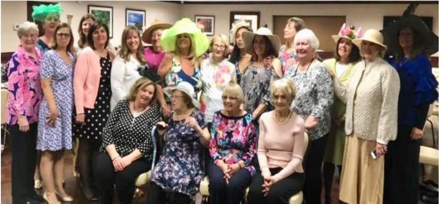
Division Seven LAOH Spring Tea Fundraiser