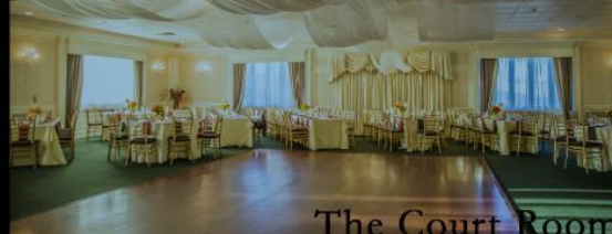
The Court Room

Full Service Catering 3 PRIVATE ROOMS CUSTOM TAILORED PACKAGES