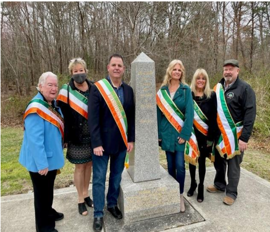
AOH and LAOH members attend the Tom Clarke/Katie Daley Clarke Memorial service on Saturday April 10 th .

Every Saturday Night Queen of Hearts drawing at 7:30