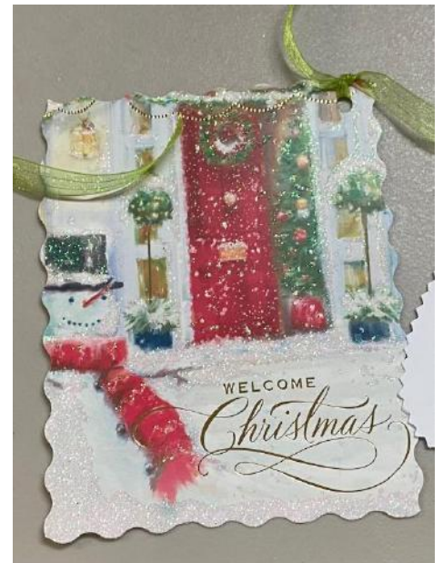
Sample of the gift tags the Jr. Girls are making for their fundraiser