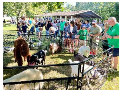
Division 7 Picnic.