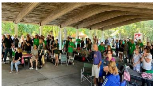
Division 7 Picnic