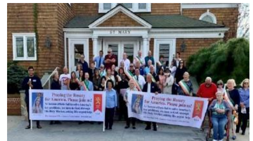
Division 7 gathered at St. Mary's to pray the Rosary on Sunday 10/16/2021