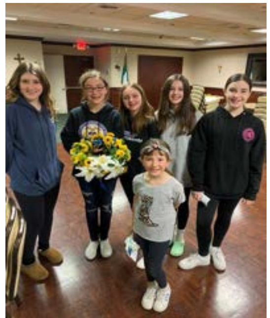
Division 7 Jr. Girls