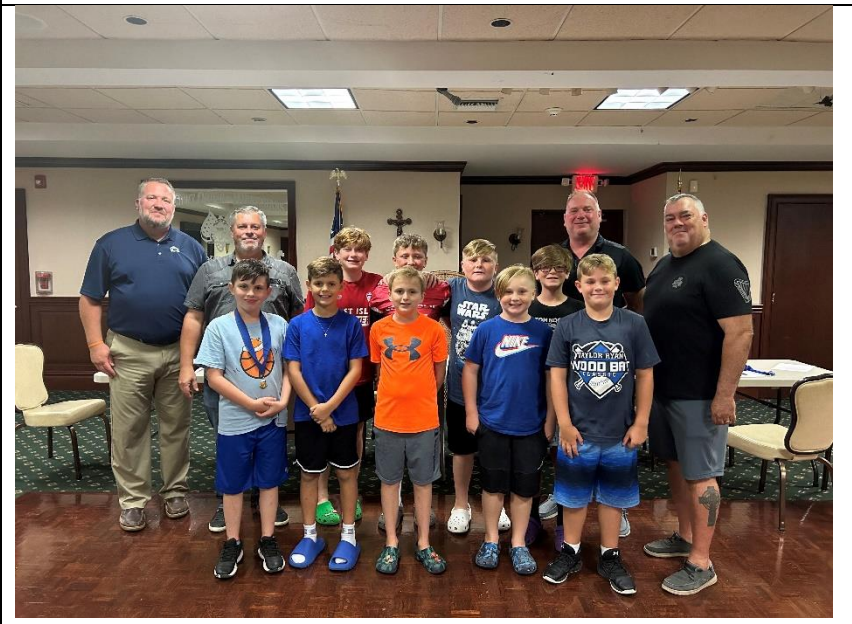
Division 7 Junior Boys at their October meeting.