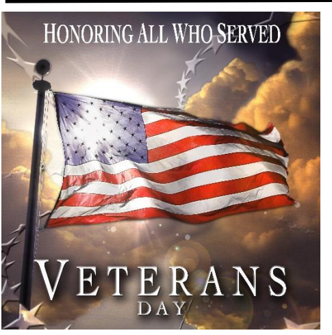
Junior Girls and Junior Boys will Host our Veterans in our Hall on Monday November 6<sup>th</sup> at 6:30 PM