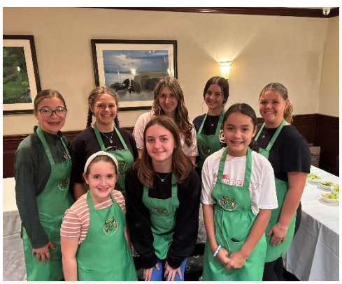
Junior Girls at their Spaghetti Dinner Fundraiser on October 20<sup>th</sup>