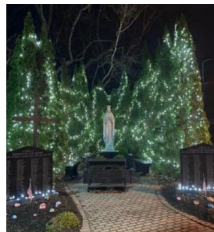
Our lady of Knock beautifully decorated for Christmas

If Dues not paid by March 17 th Dues will be $120.