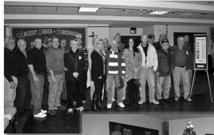
(LEFT) AOH / LAOH Division 7 Veterans pose with the plaque presented in their honor by the Junior Boys and Girls .