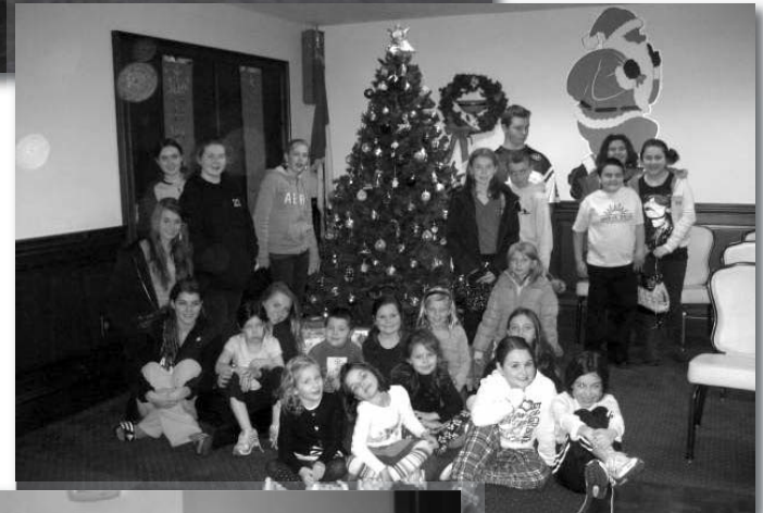
(RIGHT) The Juniors pose after wrapping numerous shoeboxes they filled with stocking stuffers to be donated to local children for Christmas.