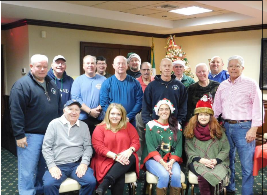
The 2019 Community Christmas Party Volunteers

Ancient Order of Hibernians Division Seven-Our Lady of Knock 65 Champlin Avenue East Islip, New York 11730