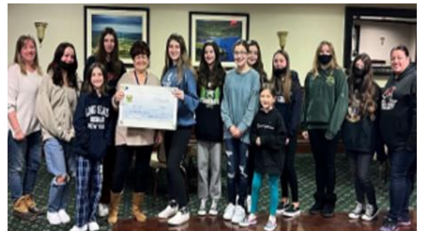
Division 7 Jr. Girls present a donation to Make-A-Wish Foundation