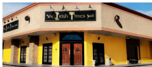
The Irish Times 975 Main St. Holbrook, New York 11741 - Phone (631) 467-4330