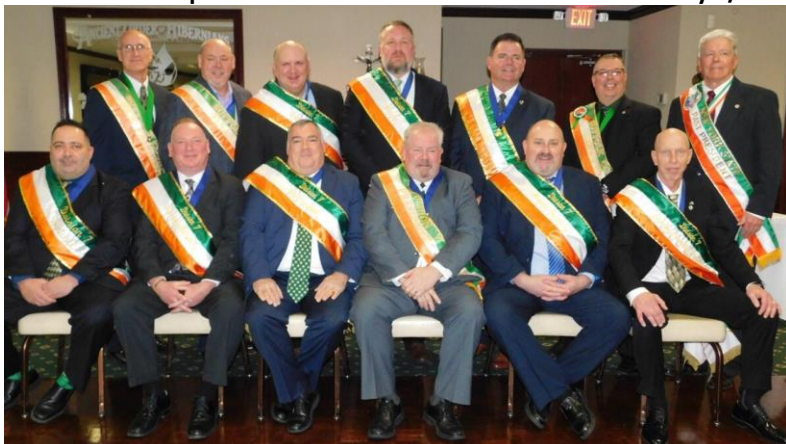
Installation of Division 7 Officers on Saturday Jan. 22, 2022