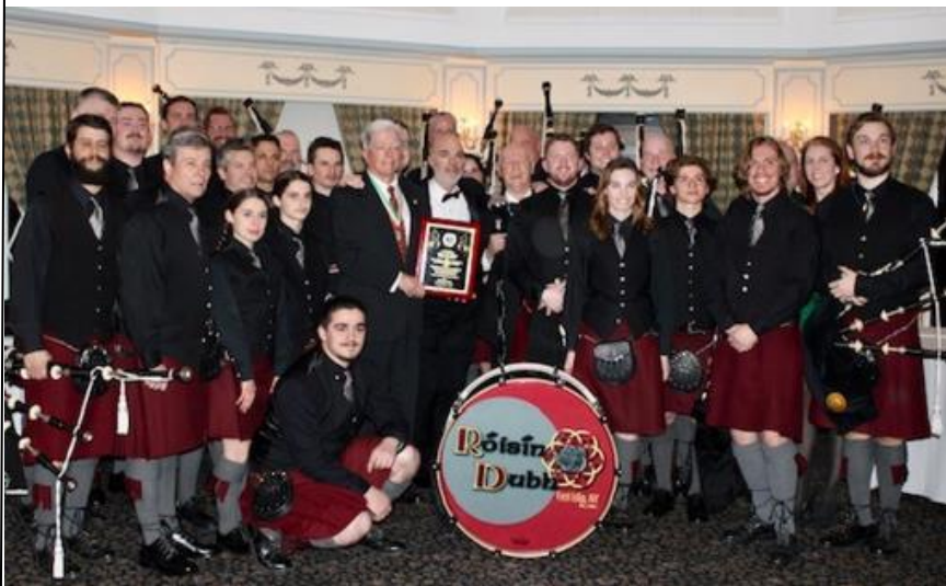
Roisin Dubh Pipe Band at the Grand Marshal Ball on Saturday 2/26

Pronunciation – Law Way-luh Paw-drig sah-nuh deev!