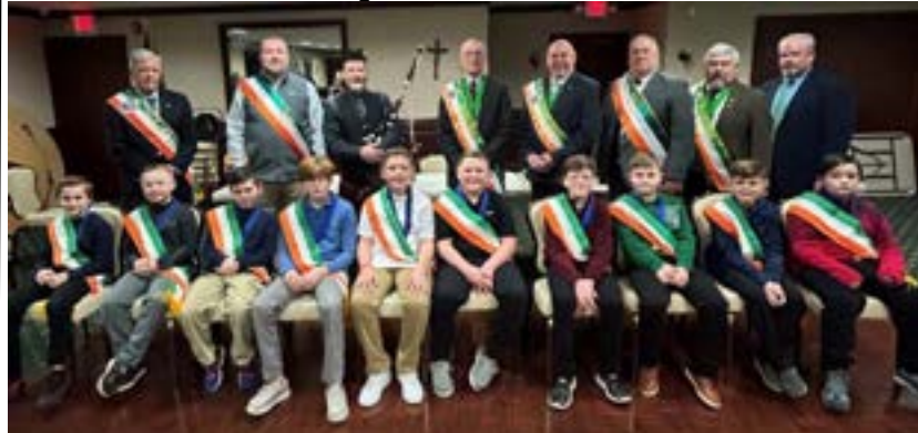
AOH Division 7 Junior Boys Division Installation February 18, 2023