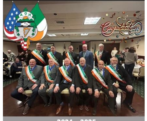
2024 – 2025 Installation of Officers