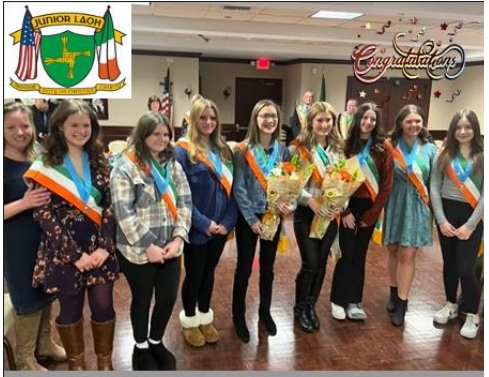
2024 – 2025 Installation of Officers