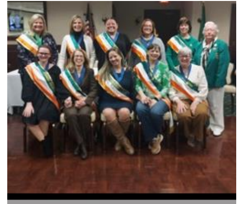
2024 – 2025 Installation of Officers