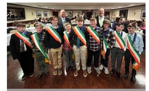
2024 – 2025 Installation of Officers