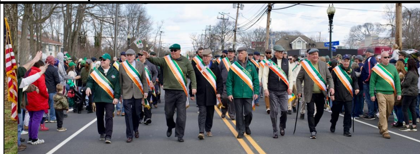
Past Grand Marshals of our John P. Rielly St. Patrick's Day Parade