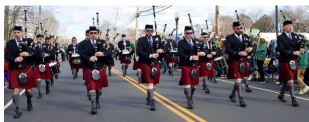
RDPB leads Div. 7 down Main St. in East Islip