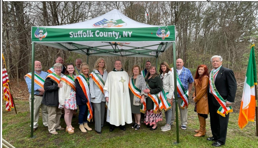
Division 7 representatives at the Tom Clarke Memorial Mass Rock