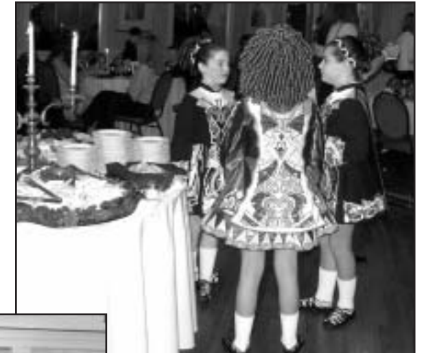
Above: "If we have the Hors d'Oeuvres will we be able to dance?"