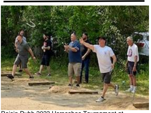
Roisin Dubh 2023 Horseshoe Tournament at Division Seven was a great success. Thanks to everyone that supported and sponsored this event.