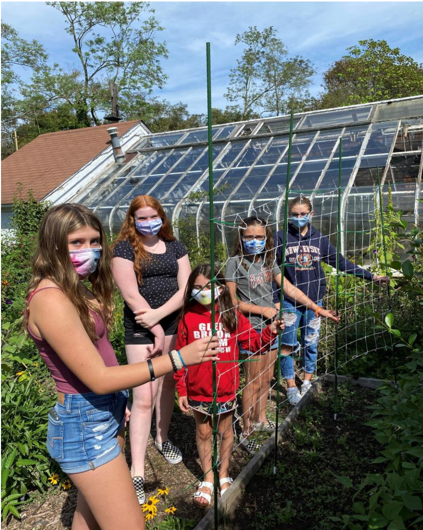
The Jr. Girls planting and tending to a Vegetable Garden located at Brookwood Hall, East Islip

Every Saturday Night we are holding a Queen of Hearts drawing at 7:30PM