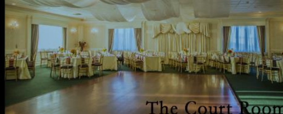
The Court Room

Full Service Catering 3 PRIVATE ROOMS CUSTOM TAILORED PACKAGES