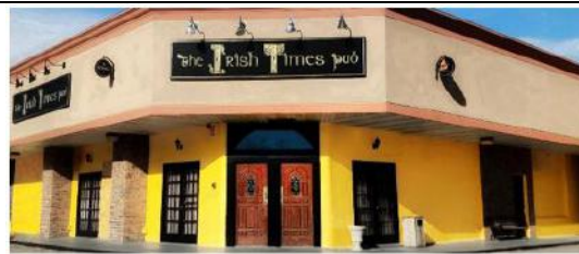
The Irish Times 975 Main St. Holbrook, New York 11741 - Phone (631) 467-4330