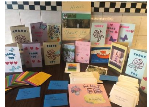
Some of the Thank You cards made by the Jr Girls