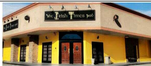
The Irish Times 975 Main St. Holbrook, New York 11741 - Phone (631) 467-4330