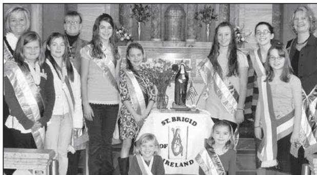
The Junior Girls at St. Brigid's Mass celebrated at the Convent of St. Joseph Academy, Brentwood, NY.