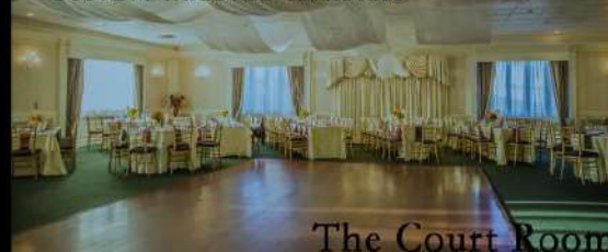
The Court Room

Full Service Catering 3 PRIVATE ROOMS CUSTOM TAILORED PACKAGES