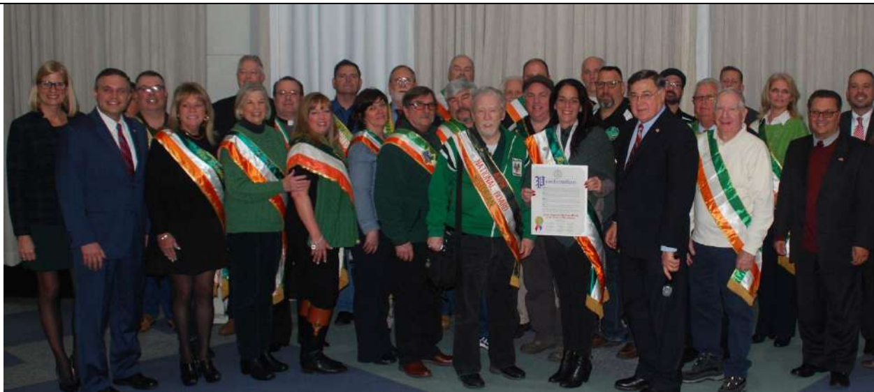
Above: Irish American Heritage Month Proclamation (Brookhaven)