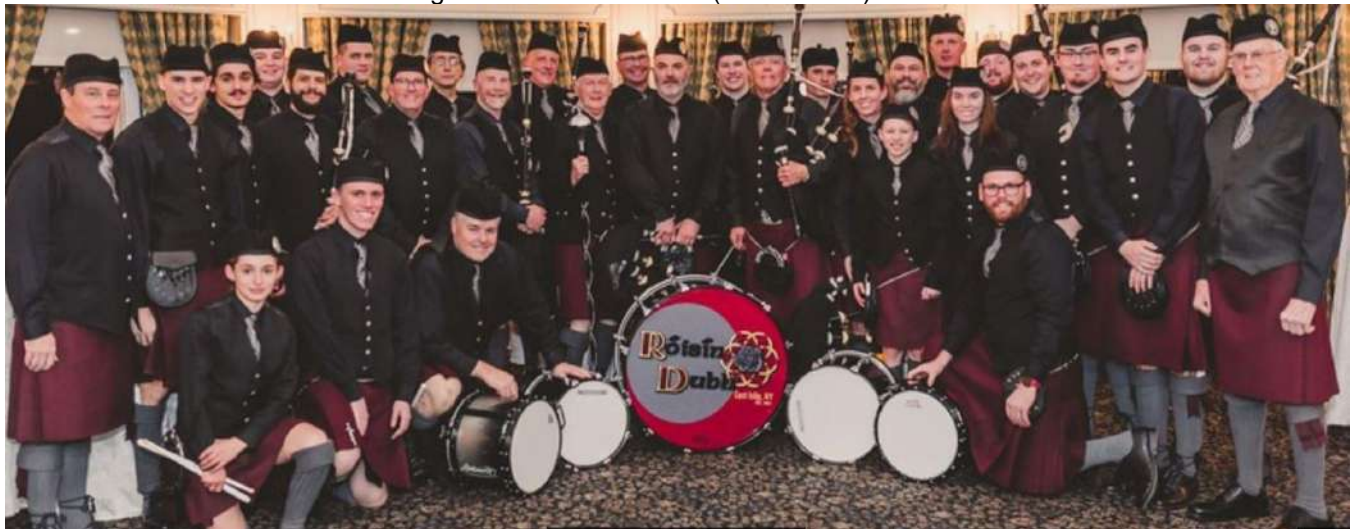
Below RDPB at our GM Ball