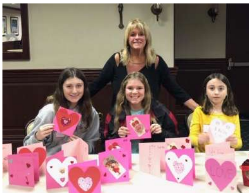
Jr. Girls make handmade Valentine's Day cards that were delivered on Valentine's Day to our homebound Division 7 AOH and LAOH members.