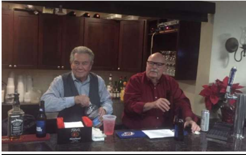
JUST LIKE OLD TIMES.