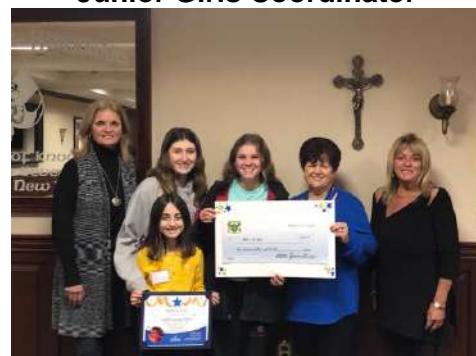
Jr Girls present check to Make-A-Wish