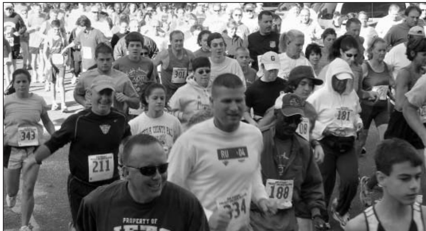
The Eight Annual Project Children 5K Walk/Run held at the Hibernian Hall on Sunday, October 16, 2005.